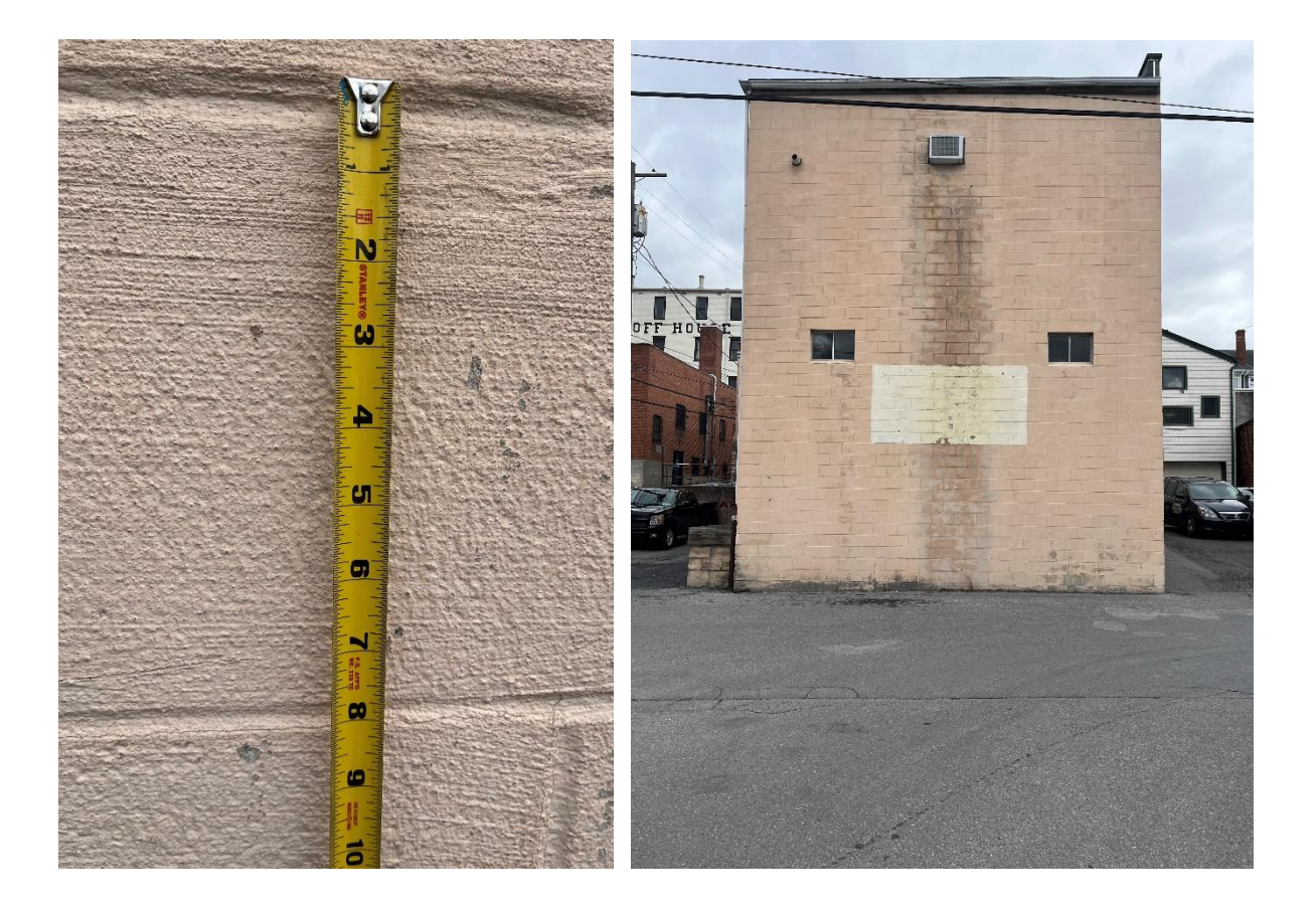
Creative Brief | Downtown Bellefonte Inc Mural Project